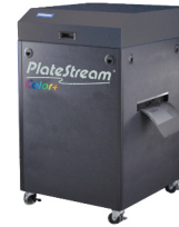
(2) PlateStream SC NEW